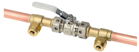
NIST Lockable Line Value

The MEC lockable line valve is manufactured in the UK under BS EN 13485 Medical Devices: Quality Management Systems and CE marked with notified body British Standards Institute under the Medical Device Directive 93/42/EEC.